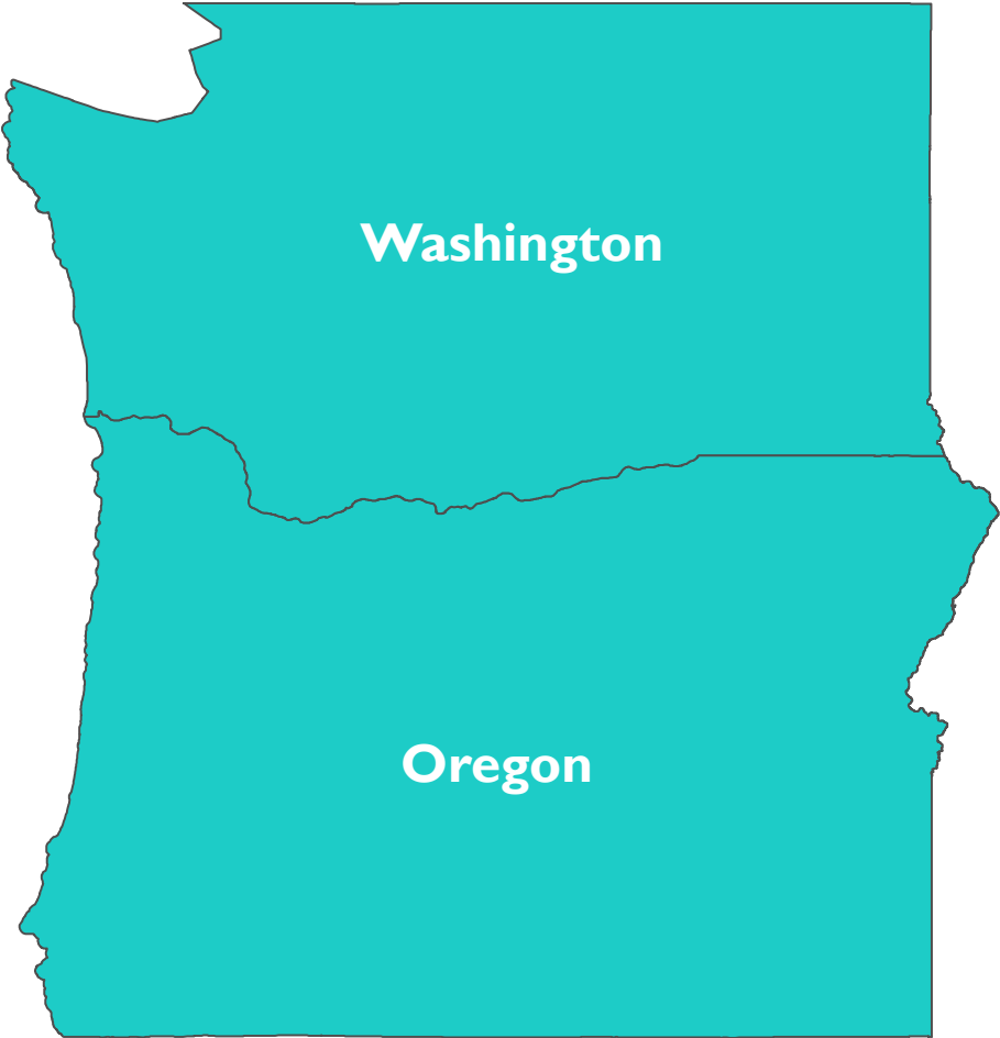
Map includes states in IHS Portland Area with one or more UIHO